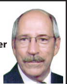
Q & A from Union County Commissioner Lamar Paris